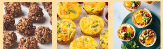
Handheld and easy!

On May 4 th we will hold an event at Jarret Prairie Ctr in Byron to honor the women in military life. We are ISO volunteers for the day of. Also looking for homemade or store-bought breakfast bites. Yum!