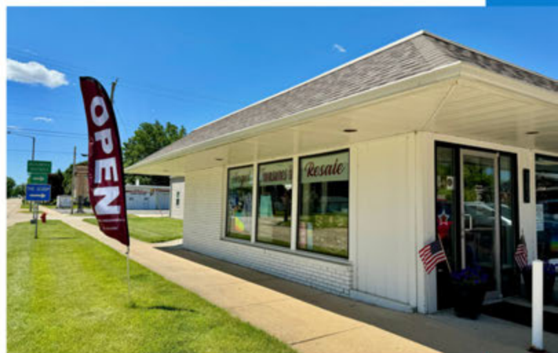
Angel Treasure II's new location at 102 N Elida St. in Winnebago, IL.