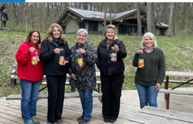
Participants at the bereavement retreat in April.

"This weekend was a beautiful, comforting, fun time with women who support and understand this life I now live. Thankful and blessed."