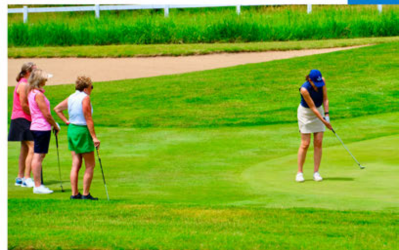
Golf Play Day at PrairieView Golf Club.