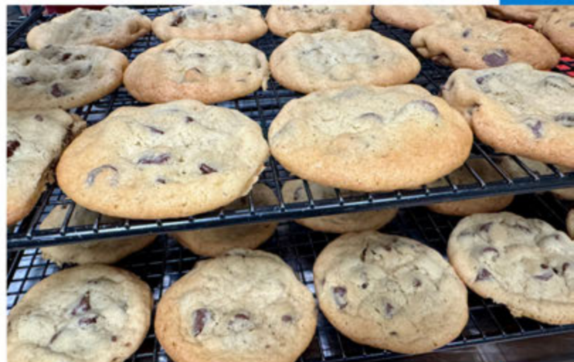
Could you resist a fresh baked cookie?