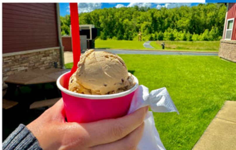
Staff enjoy ice cream during Staff Appreciation Week.