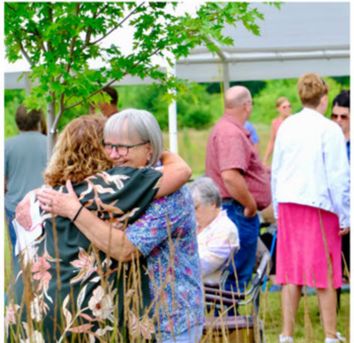
Memorial Butterfly Release Held at Serenity Home